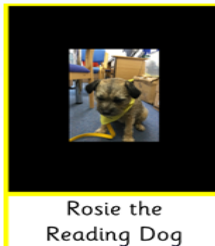
Rosie the Reading Dog