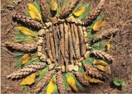
This could be a spider (with more legs)

Collect sticks, leaves, small stones etc, and make land art in the shape of a minibeast.