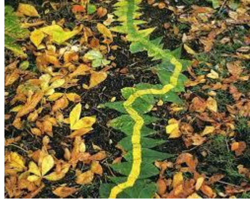
This could be a caterpillar.